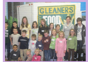
Helping our neighbors